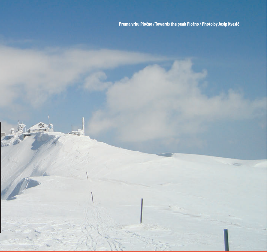
Prema vrhu Pločno / Towards the peak Pločno / Photo by Josip Kvesić