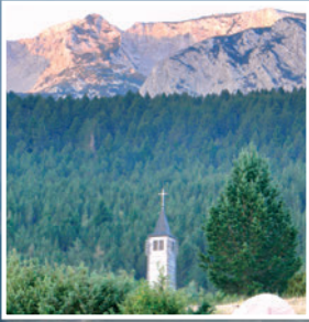
Pogled iz Masne luke prema vrhu Pločno / View from Masna luka towards Pločno peak

u koje voda dolazi prvenstveno sa okolnih planina Vrana i Čvrsnice. Dvije su legendarne osobe vezane ovaj predivni park prirode: jedna je Mijat Tomić (hajduk iz narodnih priča) koji je štiti od zuluma i nasilja, a druga je Diva Grabovčeva, mučenica i djevica iz 17. stoljeća u čiju se čast svake godine organiziraju hodočašća.