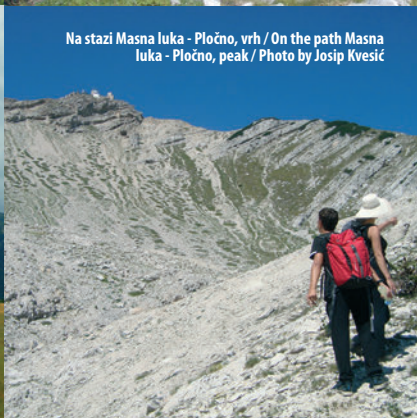
Na stazi Masna luka - Pločno, vrh / On the path Masna luka - Pločno, peak

Čvrsnica, jedna od najimpresivnijih planina visoke Hercegovine