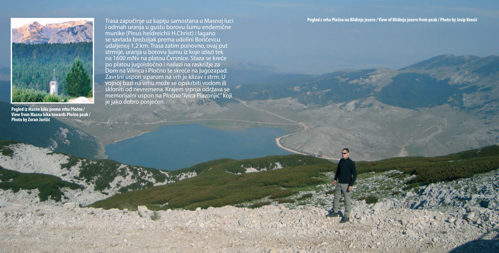
Pogled s vrha Pločno na Blidinje jezero / View of Blidinje jezero from peak / Photo by Josip Kvesić

Trasa započinje uz kapiju samostana u Masnoj luci i odmah uranja u gustu borovu šumu endemične munike (Pinus heldreichii H.Christ) i lagano se savlada brežuljak prema udolini Boričevcu udaljenoj 1,2 km. Trasa zatim ponovno, ovaj put strmije, uranja u borovu šumu iz koje izlazi tek na 1600 mNv na platou Čvrsnice. Staza se kreće po platou jugoistočno i nailazi na raskrižje za Dom na Vilincu i Pločno te skreće na jugozapad. Završni uspon siparom na vrh je klizav i strm. U vojnoj bazi na vrhu može se opskrbiti vodom ili skloniti od nevremena. Krajem srpnja održava se memorijalni uspon na Pločno "Ivica Plazonjić" koji je jako dobro posjećen.