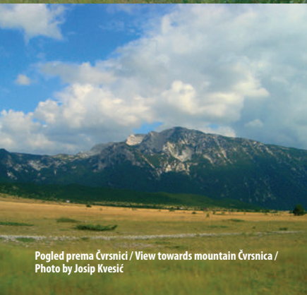
Pogled prema Čvrsnici / View towards mountain Čvrsnica