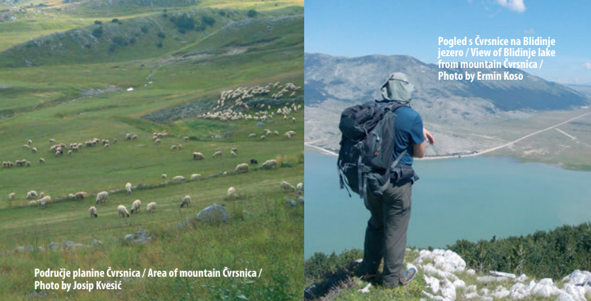
Područje planine Čvrsnica / Area of mountain Čvrsnica