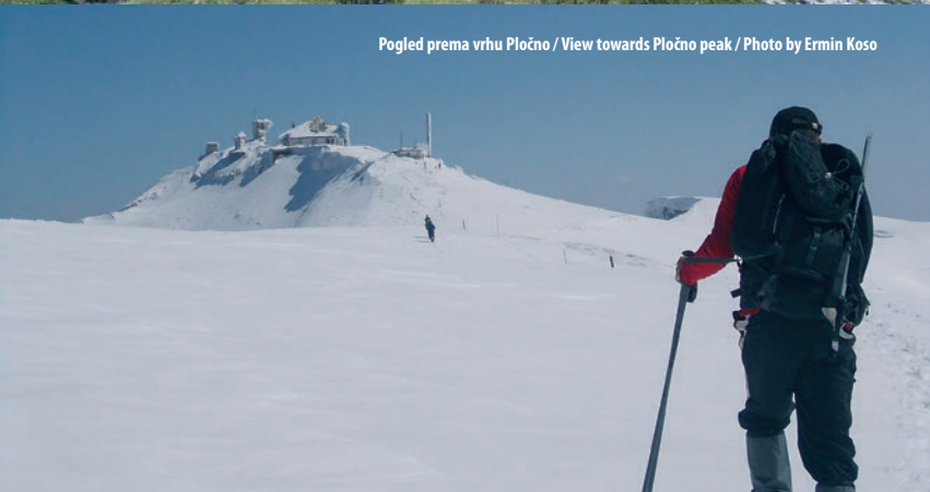
Pogled prema vrhu Pločno / View towards Pločno peak