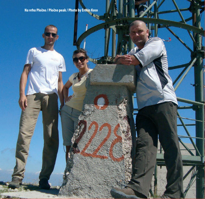
Na vrhu Pločno / Pločno peak